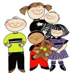
Nursery care is available at all 10:30 worship services.

Our Messy Church Congregation gathered on Friday, September 9 th for an awesome introduction to our biblical ancestors Abraham and Sarah; through this story we discovered that God's promises may start small but can