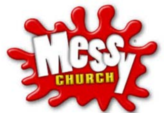
Messy Church is designed for those who cannot attend formal services on Sunday mornings

Please remember 5pm on the second Friday of the month. That's the start time and date for Messy Church. All those involved with the running of Messy Church gathered in August to reflect on 2015-2016 and to look ahead to the coming year. There is so much to celebrate. I would never have believed a year ago that one year hence we would already have another