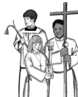
We are enriched by the dedication of our Servers.